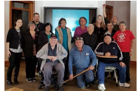
Ktunaxa Nation Elders Meeting