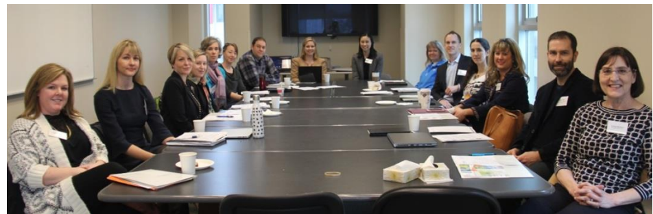
Project Working Group Members